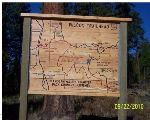
Whistler Canyon Trailhead Sign

There are many deciduous and tamarack trees along the route making this a potential for a beautiful fall color ride.